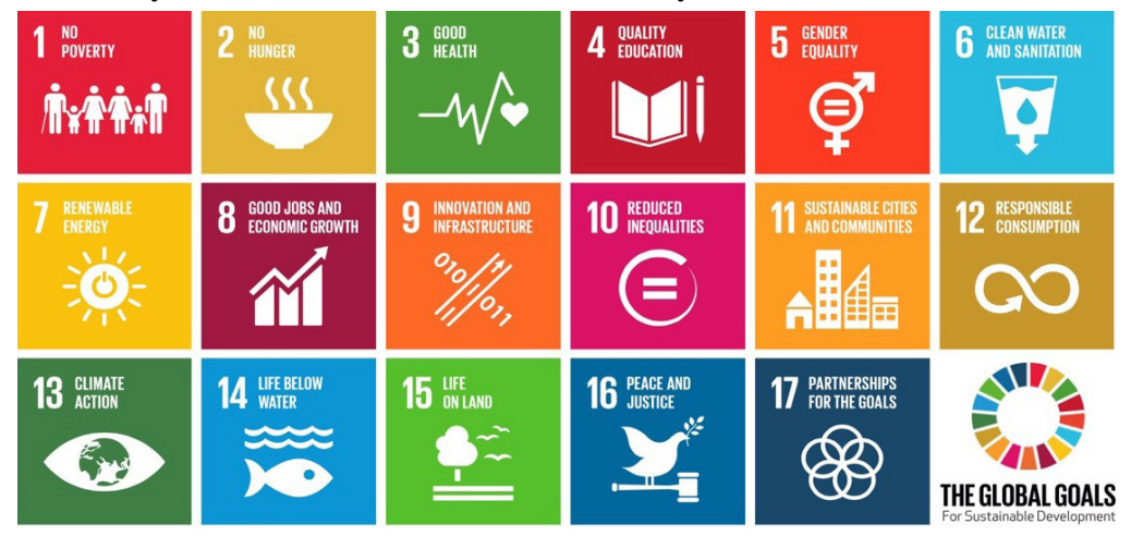
GOAL 1: NO POVERTY[4]

The 17 SDGs build on decades of work by countries and the UN: the Earth Summit in Rio de Janeiro, Brazil (1992) - Millennium Summit (2000) - World Summit on Sustainable Development in South Africa (2002) - United Nations Conference on Sustainable Development (Rio+20) in Rio de Janeiro, Brazil (2012) - General Assembly of UN (2013) - General Assembly of UN (2015).